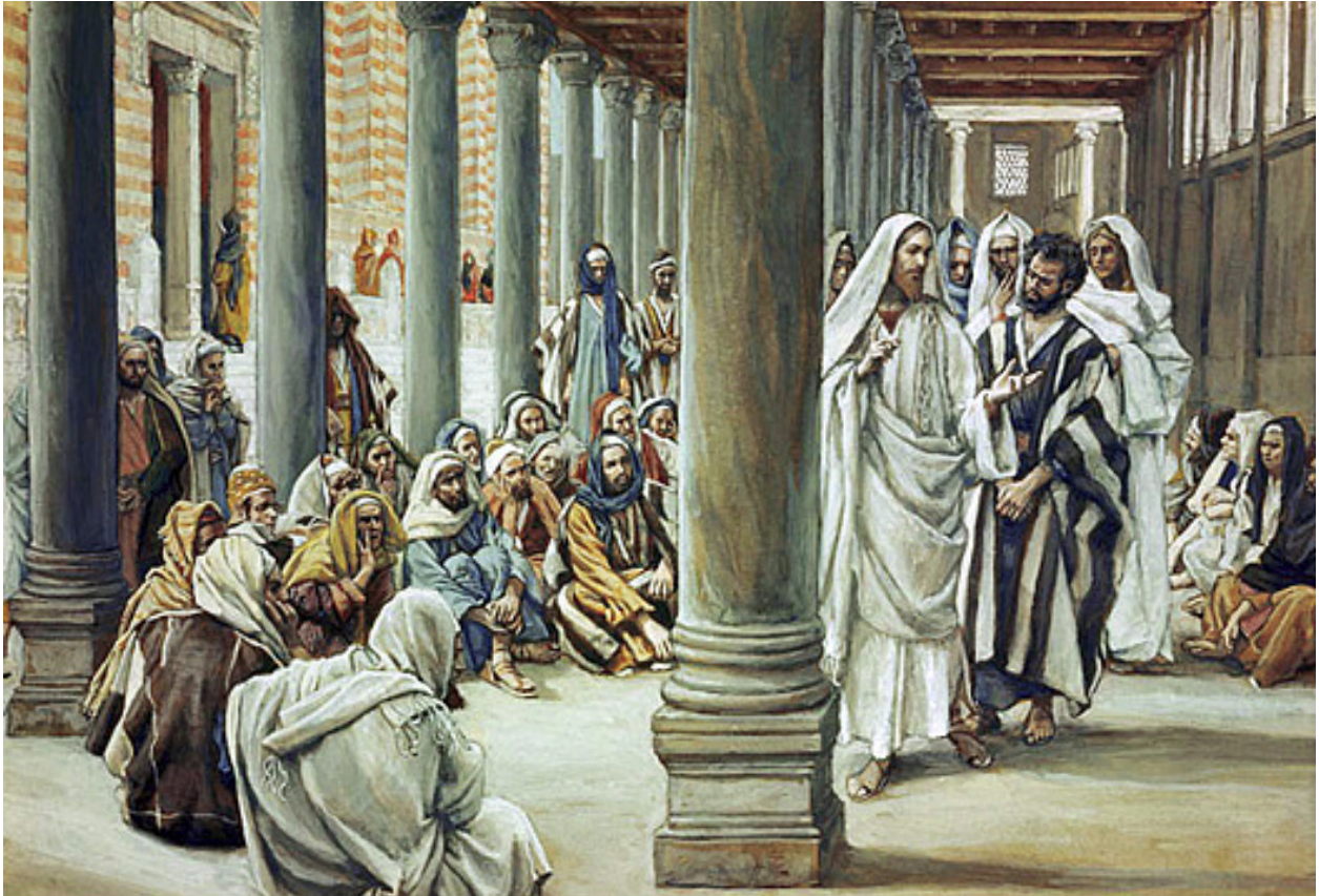
Jesus Walking on Solomon's Porch by James Tissot

"Then came the Feast of Dedication at Jerusalem. It was winter, and Jesus was in the temple area walking in Solomon's Colonnade. "