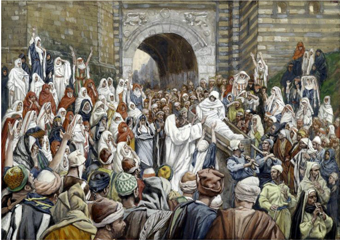
The Resurrection of the Widow's Son at Nain by James Tissot

Grace Evangelical Lutheran Church June 14, 2015