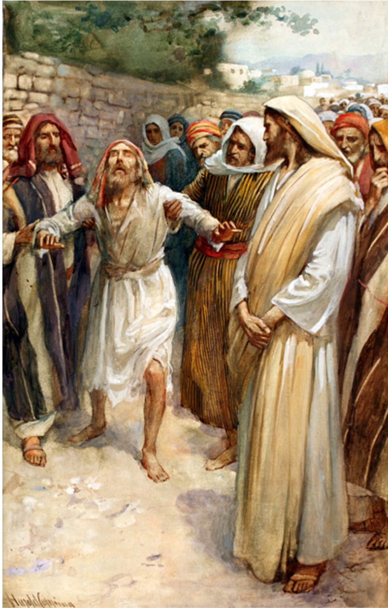
The Healing of the Blind Bartimaeus by Harold Copping

Grace Evangelical Lutheran Church October 23, 2016